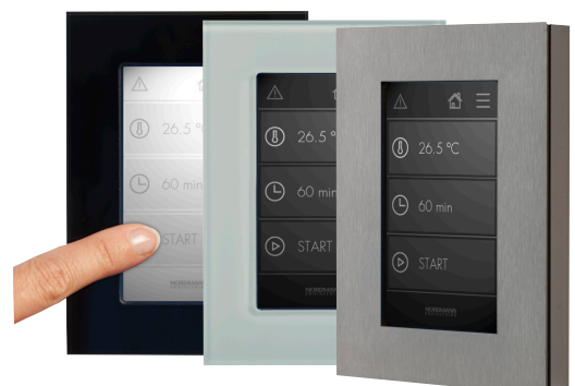
The external display in three versions

construction, however, also allows steam bath builders to individualize the fitting with a material of the customer's liking.